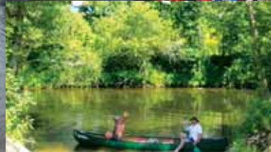
boat rental and access to the boat directly on the campsite