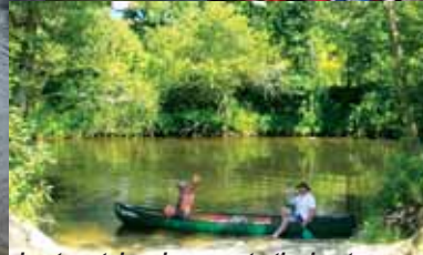
boat rental and access to the boat directly on the campsite